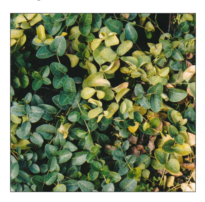
Fig. 1. Yellowing, browning and dying the of periwinkle affected by Phytophthora spp.

Observation was done on periwinkle grown in peat in 1 dm³ pots. During the summer, plants were sprinkled with water as often as 3 times a day. Appearance of watersoaked and then grayish-brown and black lesions on the base of stems were noticed. Leaf color changed to yellow-green and light brown and then the leaves died (Fig. 1). Necrosis spread on shoots up to a length of 15 cm and also on leaf petioles and blades (Fig. 2). Invaded tissues were brown and on the ends, dark brown or black. During the next few weeks, dieback symptoms were observed on the most shoots and the disease spread to other plants (Fig. 3). Shoot blight symptoms were observed mainly on cv. Aureovariegata but also on other cultivars.