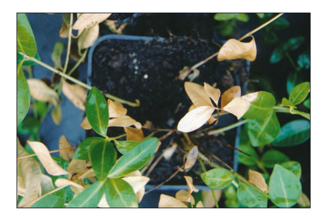
Fig. 2. Spread of necrosis on periwinkle shoots infected by Phytophthora spp.