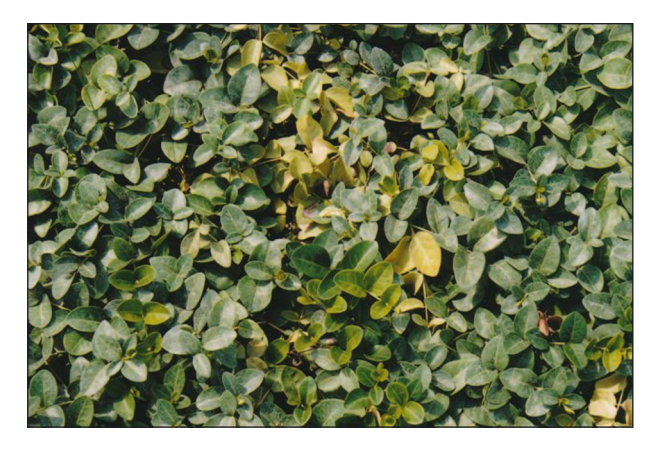
Fig. 3. Plots of periwinkles in the nursery, affected by Phytoph-thora spp.